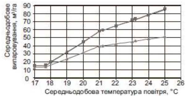
Fig. 2. Schedule for determining the average daily evaporation of tomato in different ways of watering at the average daily temperature of air: - sprinkling; - micro-purchase; - drip irrigation

Consequently, for drip irrigation at 1oS, the moisture is consumed by 72.7% less than for watering. In the temperature range of 21.2-23.2 ° C, despite the overall growth of total evaporation, specific costs are reduced to 4.4 m3 / ha at 1 ° C for sprinkling and up to 2.1 m3 / ha at 1 ° C for drip irrigation. The intensity of evaporation in this temperature range is 3 and 3,7 times less than in the range 17.7 - 23.2 ° C. This confirms the presence of a temperature threshold, the excess of which significantly reduces the specific evaporation, probably due to the reduction of transpiration intensity, which is regulated by the size of leaf products, which depend on the temperature and humidity of the air. The temperature range in which the most intensive moisture exchange in tomato plants was observed in our conditions was in the range of 17.7 - 23.2 ° C, that is, in the range of 18 - 25 ° C, which according to the results of studies [7] is optimal for tomatoes. An attempt to approximate the average daily evaporation on the functions of B. Gompertz and P. Ferghults did not give satisfactory results in the range 10.9 - 17.7 ° C. Therefore, the average daily evaporation approximation by the average daily air temperature is carried out by a linear spline within each temperature regime: