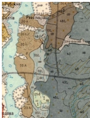
Fig. 1 Deep solonetzic chernozems (cipher 85) and deep leached ordinary chernozems (cipher 48) between podzolized by coherent-sandy and sandy loam soils of the first overfloodplain terrace and medium-humus heavy-loam typical chernozems (cipher 43) (Vovchansky district of the Kharkiv region)

In analyzing the cartographic material of a large-scale soil survey of 1957-1961, it was discovered that the highlighted soil differences do not always correspond to reality and contradict the law of zonality. So, for example, on terraces of the Severski Donets in the forest-steppe zone, ordinary chernozems are common (Fig. 1,2).