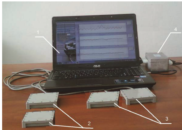
Fig. 2. Mobile measuring and registration complex: 1 - RS with an author's software package; 2, 3 - sensors of accelerations of MMA 7260QT; 4 - analog-digital converter of a signal of a tenzounit.

2), for testing MAU developed at the Department of tractors and automobiles of P. VasilenkoKharkov National Technical University of Agriculture.