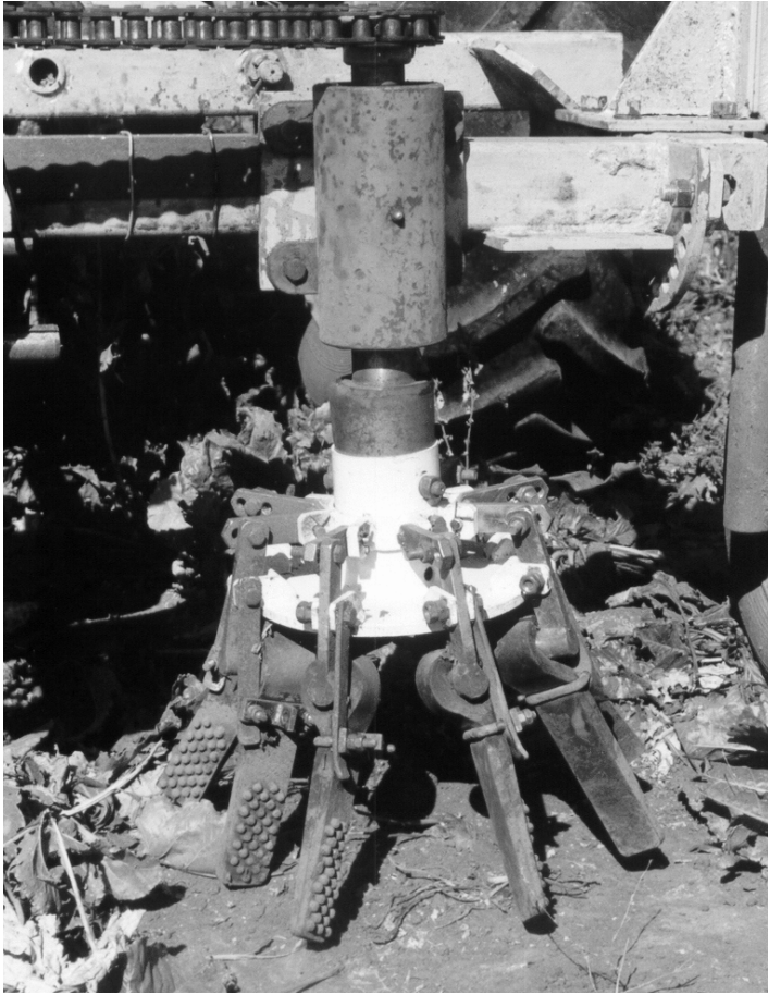
Fig. 3. Cleansing shaft of cleanser of heads of root crops

As a result of experimental research and field trials of a jig-maker, made in the 3-row version, for a wheeled tractor of the traction class 1.4, it was established that the harvesting capacity of the jig is 1.5 ... 1.7 ha/h. The capacity for the continuous process of cutting the sugar beet hinge with a self-winding machine is 8.5 ... 14.5 kW, and the tractive power does not exceed 5 kW. The best quality performance of the hoeing machine, this design (the completeness of the continuous cutting of the hook - up to 80.5 ... 90.0%) was obtained at the rotational speed of the rotary cutting machine 800 ... 950 min -1 , and the height of its installation above the level of the soil surface - 0.04 ... 0,06 m. When using a three-row cutting machine, the number of clipped tops is about 95 ... 98%. The degree of damage to root crops does not exceed 5%, which is within agrovimage. However, with the continuous cutting of the tops, there is a too high percentage (60 ... 65%) of crushing its leaves and stems.