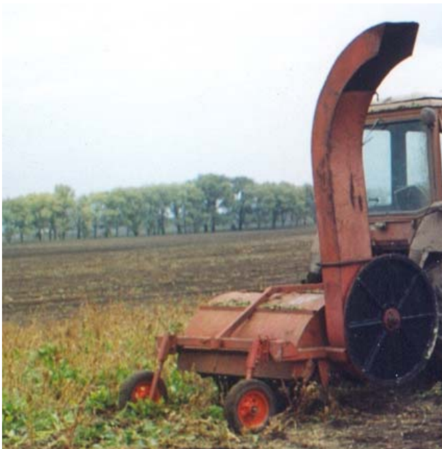
Fig. 2. A three-row implements frontal hinged on a wheeled tractor

In fig. 2 gives the appearance of a front-mounted hinged machine in 3-row execution. The technological process of collecting sugar beet tops is carried out in this way. The front-mounted on the catch 2, the hook-making machine II carries out a continuous, uncompressed cut of the hinge mass at the overheated installation of its 4-rotor type shearing machine, which is provided by the copper wheels 3 with the adjustment mechanisms of the height. The technological process of direct cutting the mass of the hinge by the hinged hook assembly I occurs as follows: the hinge is cut off by a rotary gyro cutting device 4 located on a frame 1, which has flat-knife S-shaped joints mounted on the drive drum. In this case, the rotary shearing cutter 4 has a counter-direction of the rotational motion of the cutting drum, and therefore its knives are mounted on the drum in such a way that their cutting parts overlap the entire plane of the capture area of the hoisting machine, lifting the cut weight of the tops upwards. Next, it enters the transport and supply working body 5, which has a transverse screw conveyor, the length of which is equal to the width of the hook of the hoisting machine, at the end of which a shovel shaft 6 is installed. Then, with the aid of the shipment, that is, the shaft 6, the cut weight of the hoop rises upwards and loaded into the body of the vehicle moving alongside the collected part of the field.