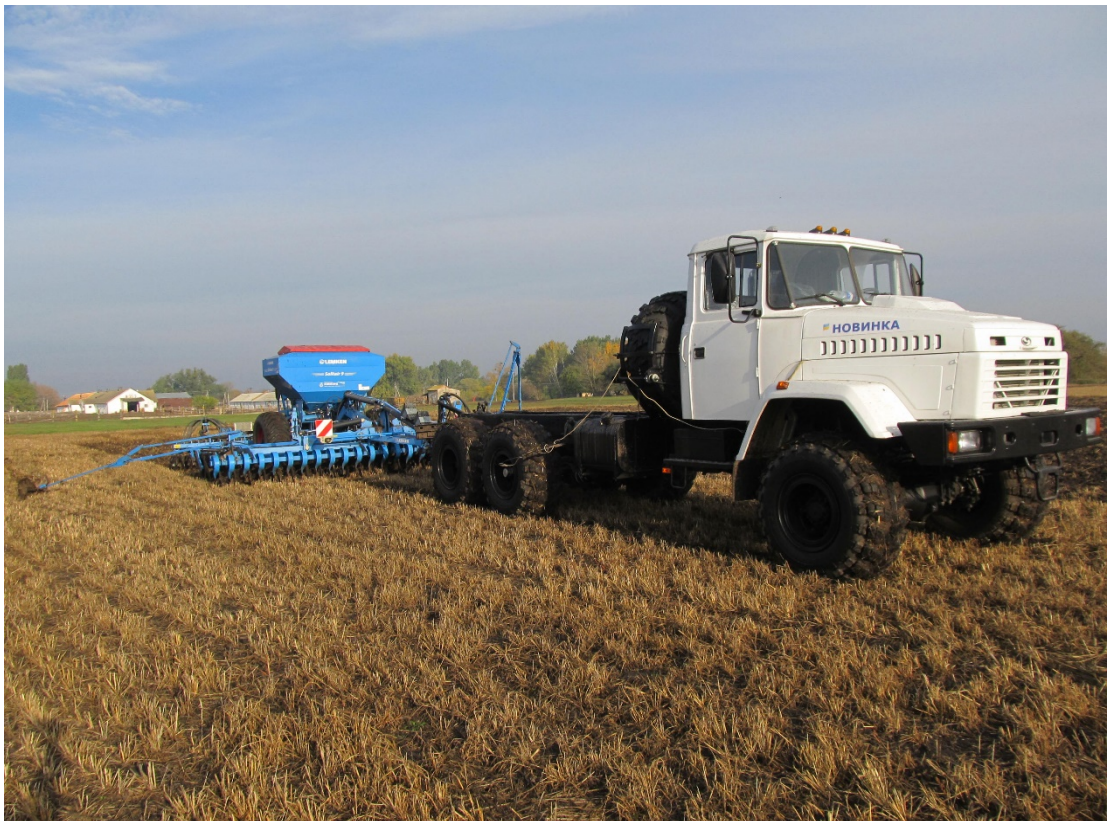
Fig. 6 - MEZ-330 with sowing complex Solitair 9

In addition to the advantages mentioned above, the use of multifunctional ME3-330 "Autotractor" in agroindustrial production has the following advantages: