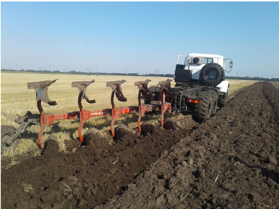
Fig. 4 - MEZ-330 with 5 housing plow XMS950