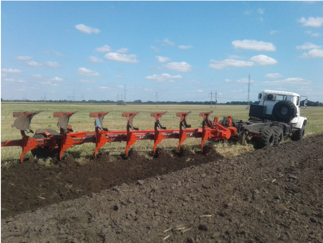
Fig. 3 - MEZ-330 with 7 hood plow Hektor-1000