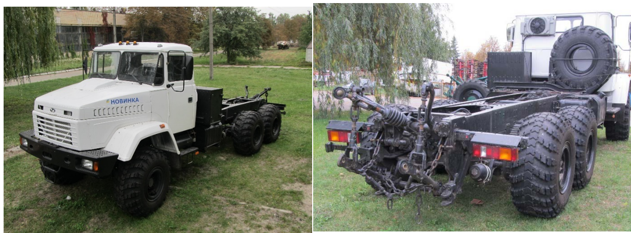
Fig. 1. Mobile power means MEZ-330 "Autotractor"

As a result of joint work of PJSC "AvtoKrAZ" and NSC "IMEA", a mobile power sowing (MEZ-330) "Autotractor" was created (Fig. 1).