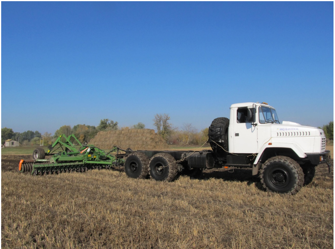
Fig. 5 - MEZ-330 with disk harrow Catroc 6002-2TS