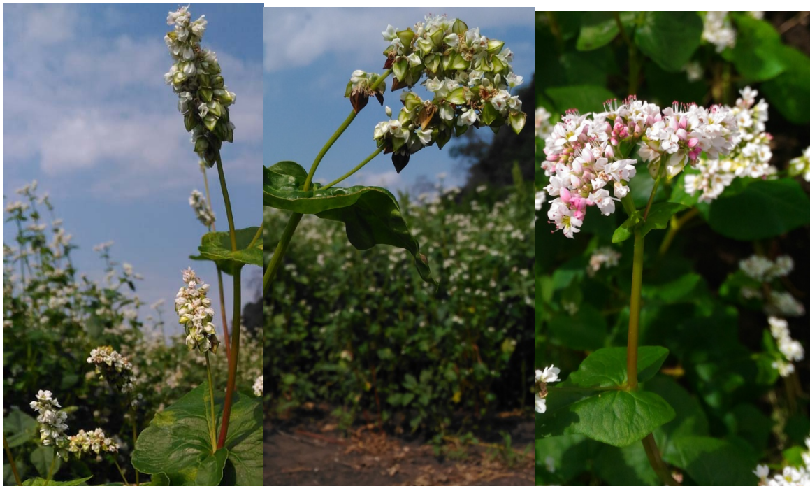
Fig.1. Forms of Inflorescence of Determinant and Ordinary (Indeterminant) morphotypes of buckwheat (1. 'Sumchanka' variety – a single raceme; 2. 'Yaroslavna' variety - a double raceme; 3. Simka variety – an umbel)